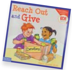
2010’s book on giving.