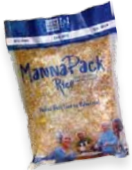
Feed My Starving Children MannaPack™ Rice.

Feed My Starving Children is a nonprofit organization committed to feeding children hungry in body and spirit. The approach is simple: children and adults hand pack meals specifically formulated for malnourished children. The organization ships the meals to nearly 70 countries around the world.