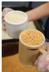
Help for the hungry.

This past year, Food For The Poor, Inc. received their $20 check. And Feed My Starving Children received their volunteer hours.